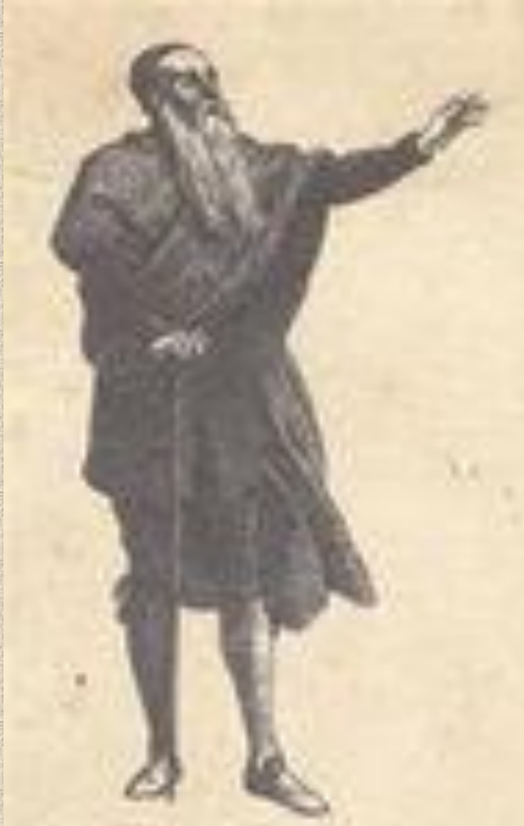
Alexander Peden (1626 – 1686)