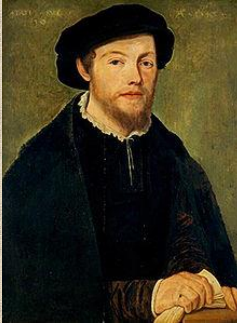
George Wishart (1513 – 1546)